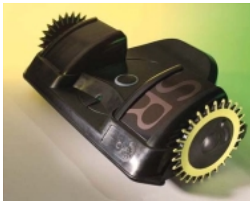
Figure 1. Cye sr

The Cye and Cye sr are pre-assembled personal robots designed by Probotics, Inc. to perform various tasks for a user. The Cye sr, used in this project, is only an extension of the original Cye robot with more motion techniques via additional sensors. It is approximately 16 inches wide, 10 inches long and 5 inches in height, weighs about 9 pounds (as shown in Figure 1) and moves at 3 feet per second. The Cye requires at least a Pentium 133MHz PC with 19mb of free space, running Windows 95 or 98 but not yet certified for use on the Windows 2000 operating system. It also comes with the capability of interfacing user devices such as on-board cameras, and, for additional costs, wagon and vacuum attachments are available. There is a serial port on the Cye sr that looks like a feed although it exposes the radio link with heavy protocol.